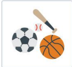
MIDDLE & HIGH SCHOOL ATHLETICS