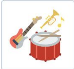
MIDDLE & HIGH SCHOOL MUSIC