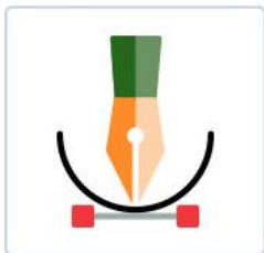
VISUAL ARTS & TECHNOLOGY PATHWAY