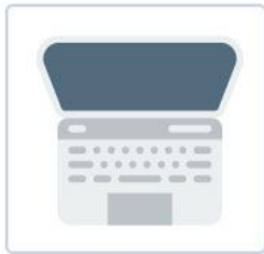
1 TO 1 CHROMEBOOKS