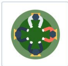
BUSINESS ENTREPRENEURSHIP PATHWAY