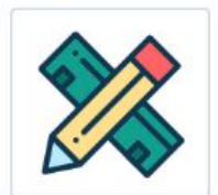
SCIENCE AND TECHNOLOGY PROGRAMS