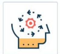
RESPONSIVE CLASSROOM SCHOOL