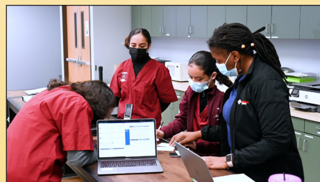
Natomas High School CTE Healthcare Pathway Students will work in the new clinic facilities.