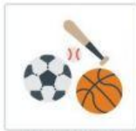
MIDDLE & HIGH SCHOOL ATHLETICS