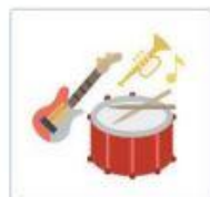
MIDDLE & HIGH SCHOOL MUSIC