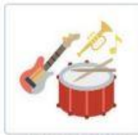
MIDDLE & HIGH SCHOOL MUSIC