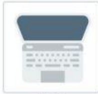
1 TO 1 CHROMEBOOKS