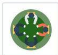
BUSINESS ENTREPRENEURSHIP PATHWAY