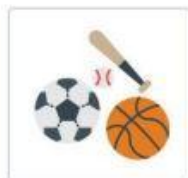
MIDDLE & HIGH SCHOOL ATHLETICS