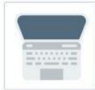
1 TO 1 CHROMEBOOKS