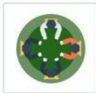
BUSINESS ENTREPRENEURSHIP PATHWAY