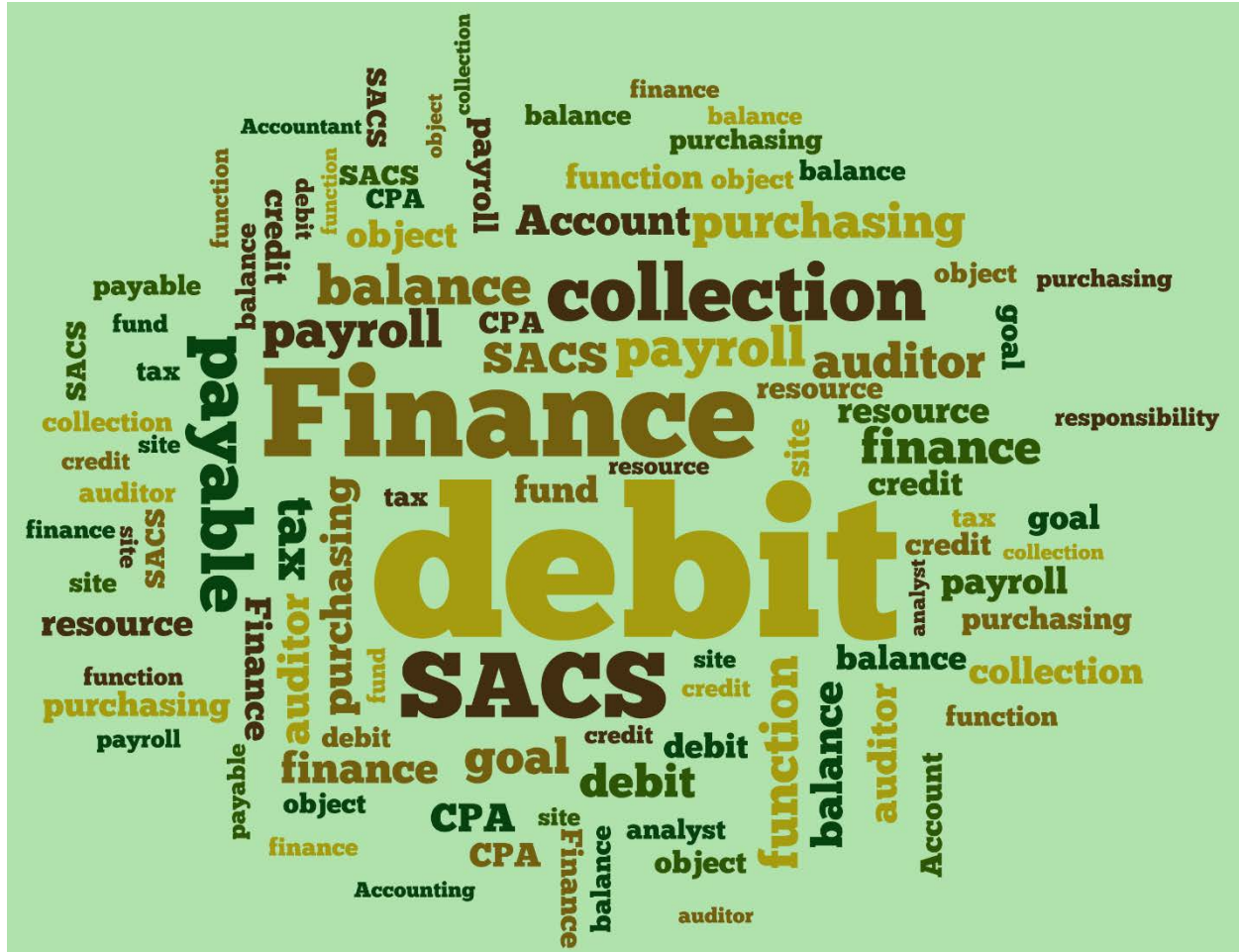
Chart of Accounts